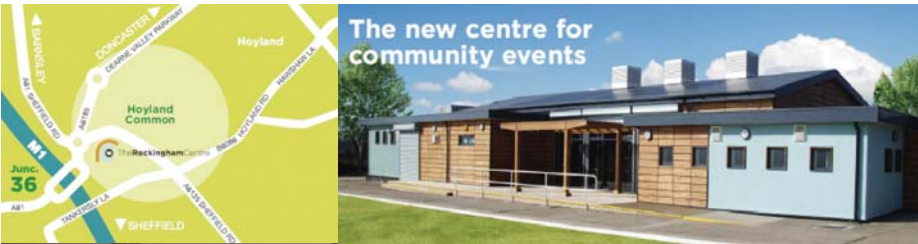
The new centre for community events

For bookings and information please call: 01226 745161 or email us at: info@therockinghamcentre.co.uk