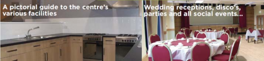
A pictorial guide to the centre's various facilities