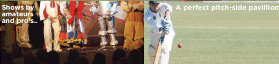
Shows by amateurs and pros...