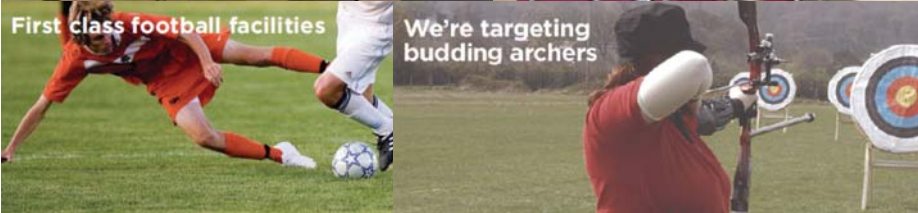
First class football facilities